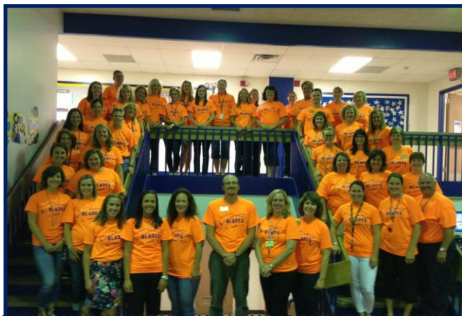
Blades staff shows they are a family by demonstrating unity through their thoughts and actions.